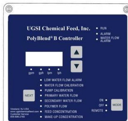
Polyblend® Polymer Feed System “B” Controls