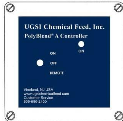
Polyblend® Polymer Feed System “A” Controls