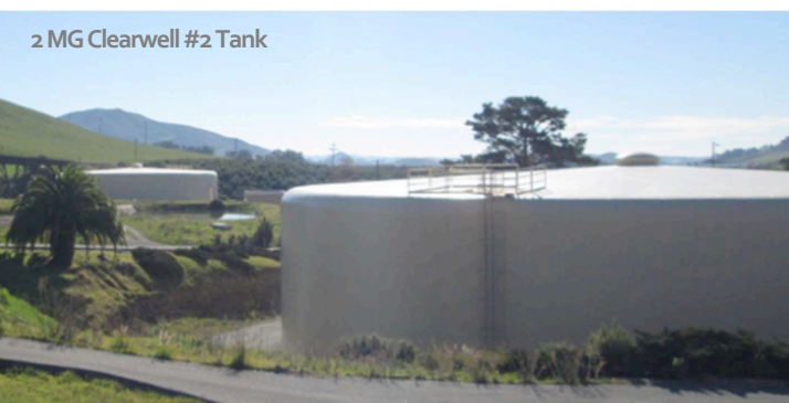
2 MG Clearwell #2 Tank

As, water age increases, THM formation naturally progresses. (Water age refers to the time from water treatment in a plant to ultimate use.) THMs can be removed by a process known as air-stripping as they are volatile compounds – meaning that they can be readily moved from the water (liquid phase) into air (gas phase) with the application of carefully calculated mixing energy and adequate tank-headspace ventilation.