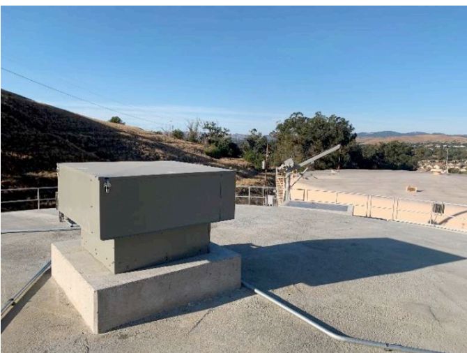
PAX PowerVent® headspace ventilation unit on Cement Hill Tank