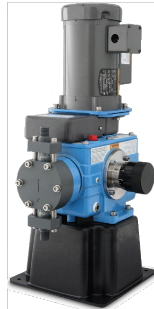
Encore® 700 Pump

Needless to say, after successfully passing many tests to judge the pump's performance, JWD operators added more Encore® 700 pumps to their distribution system. They believed these yielded higher quality output and decreased operation costs.