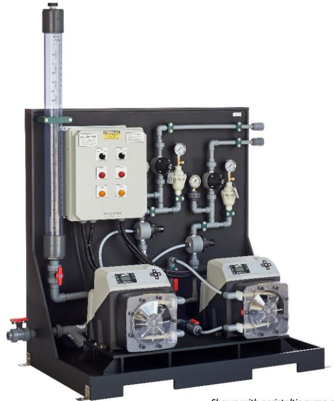
Shown with peristaltic pump option.