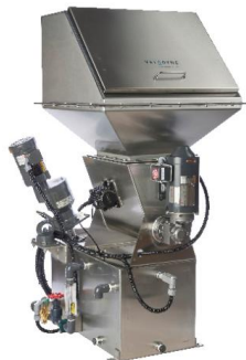
Small Bag Dry Chemical Processing Systems