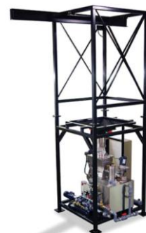
Bulk-Bag Dry Chemical Processing Systems