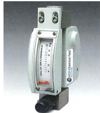
Arma-View® II Low Flow Armored Purge Meter