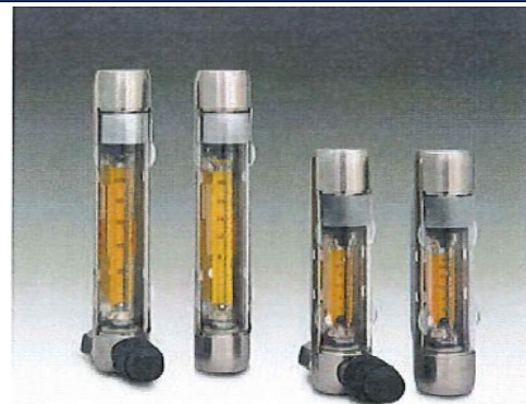
Glass Tube Purge Meters with Stainless Steel Frame