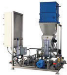
Dry Polymer Activation