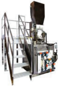
Manual Bag Systems