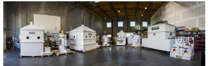
Poway Manufacturing Facility