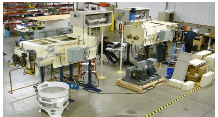
Zeeland Manufacturing Facility