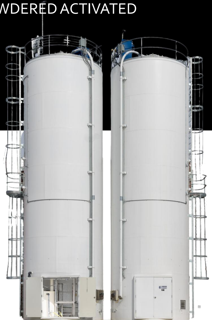
Bulk Chemical Storage and Feed System

BULK CHEMICAL STORAGE & FEED SYSTEMS FOR HYDRATED LIME, QUICKLIME, POWDERED ACTIVATED CARBON (PAC), AND SODA ASH