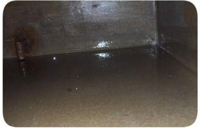
Solids Sump After Acid Wash