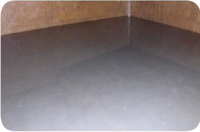
Clear 12" Block of Caustic