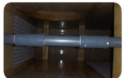
Packed Bed After Acid Wash