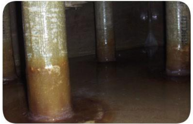
Sump After Acid Wash

To access our full assortment of case studies, data sheets, brochures and more, visit our document library at https://documents.cleanwater1.com or scan the QR code.