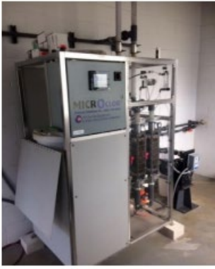
Aqua Engineers Aqua Puhi Site with 40 pound per day (PPD) Microclor® OSHG unit

a build-up can be observed on the cells by viewing through the transparent cell housings. This cleaning routine may occur as frequently as once per quarter to once per year depending on the quality of salt and softened water.