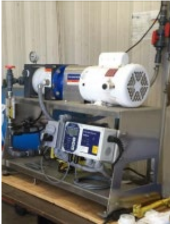
Polyblend® M-Series Pilot Unit