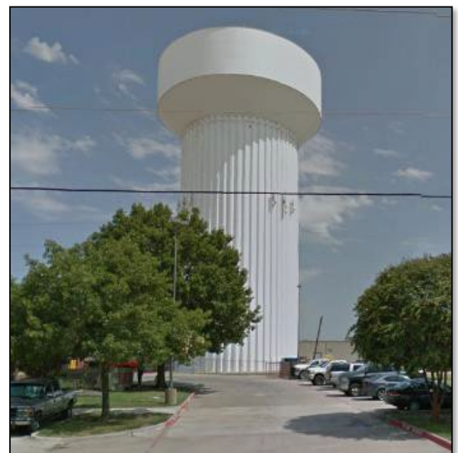
1.5 MG Southwestern Tank – Tower 1

Like many cities within the Dallas-Fort Worth metroplex, Coppel experienced water quality challenges at different periods throughout the year. In particular, the City had difficulty maintaining adequate chloramine residuals at the 1.5 MG Southwestern elevated storage tank during the warmer summer months when outdoor watering was restricted to conserve water. The reduced demand in that area of the system meant less turnover in the storage tanks, resulting in higher water age and chloramine residual decay. Ironically, the City experienced similar water quality problems during periods of rain, as customers curtailed their outdoor irrigation.