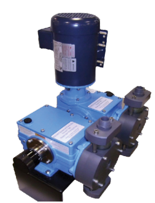
Encore® 700 Double Simplex Pump

With cleanwater1 products, you do not have to compromise on a marginal liquid feed and controls technology for a particular application. Instead, you can choose from multiple technologies to match the best pump to your application.