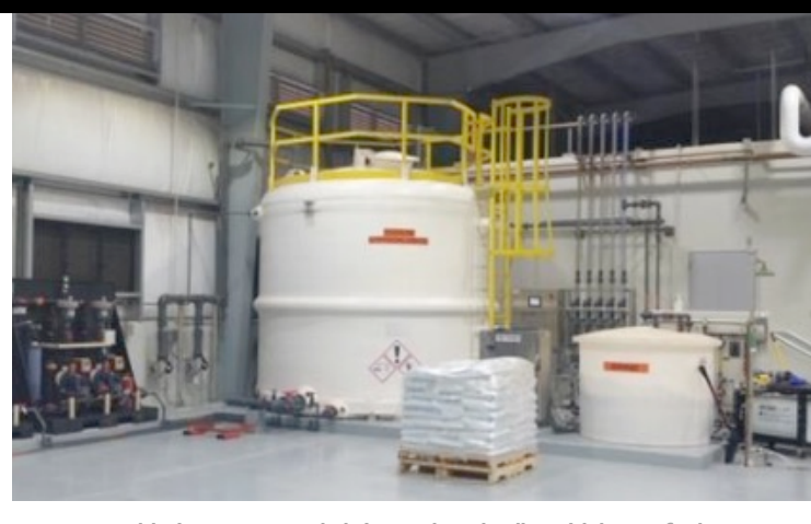
DSW Hypochlorite storage tank, brine tank and pallet with bags of salt.

DWS was extremely satisfied with the convenience of the Microclor® OSHG. The project, as initially outlined, required all four systems to be up-and-running within a year. Field work commenced a week before the designated deadline. The conversion to sodium hypochlorite generation was completed ontime and on budget without any change orders. Since then, the Microclor® OSHG has enabled DSW to reduce costs and increase operational efficiency.